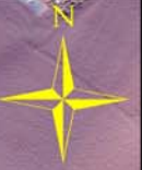
Image scale 1:4250 on A3.