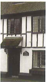
local building materials