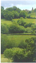
small irregular fields