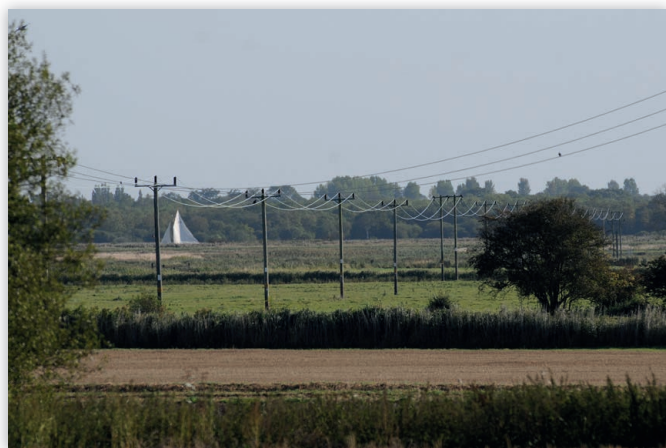
St Benets Levels, Norfolk and Suffolk Broads - before...

This steering group has an established constitution and has developed an assessment methodology to prioritise undergrounding projects.