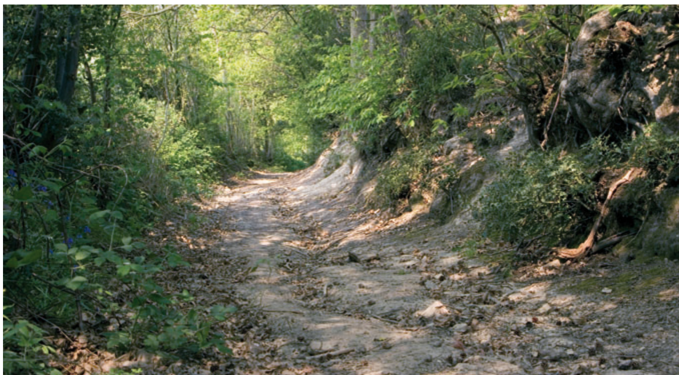
Sunken trackway alongside Broadham Wood, near Kilndown in the High Weald (photo - PM)

13 Forestry Authority (1995) Forests and Archaeology Guidelines. Forestry Commission, Edinburgh