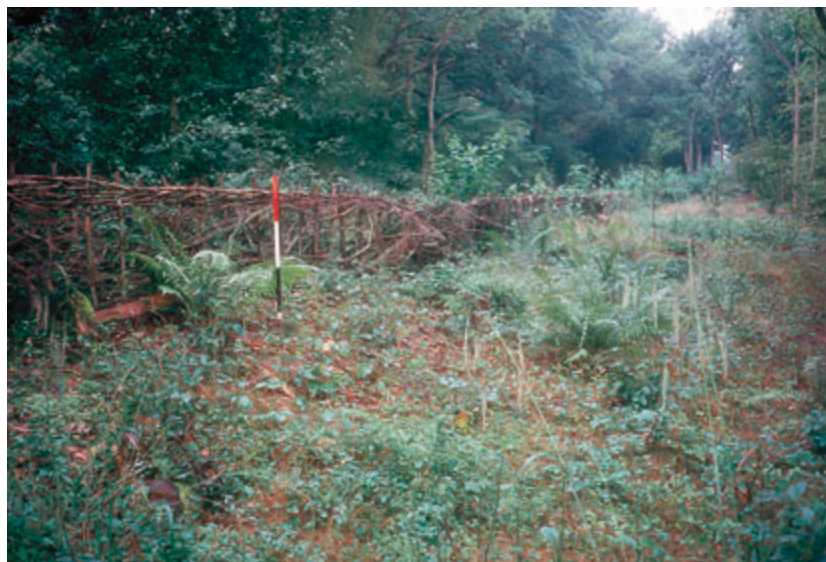
Wood bank and laid hedge at Highfield Wood near Wanborough in Surrey

Living features include all forms of veteran trees and other significant trees, which provide evidence for the past land use history of the woodland. Repeated cutting of trees to provide a supply of underwood and timber prolongs their life, and creates aged and veteran specimens. These include ancient coppice stools, boundary stubs and pollards. These trees are vitally important habitat sites for a very wide range of flora and fauna. They are also often highly significant features within the countryside, adding to local character and distinctiveness.