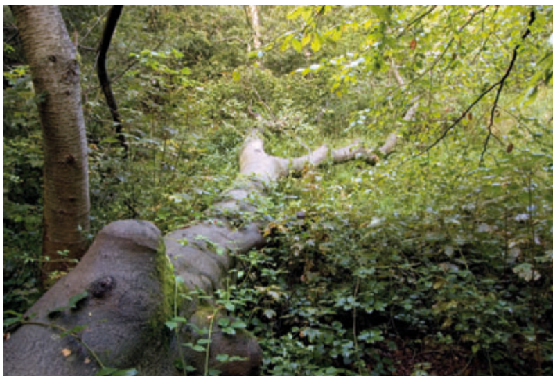
Fallen tree on a Late Neolithic or Bronze Age burial mound at Box Hill in the Surrey Hills, showing how easily archaeological features can be damaged in woodland

However, during the first half of the 20 th century, when many ancient woodland sites were planted with commercial species, especially conifers, considerable disturbance took place to the archaeological resource preserved within the woods. The disturbance, though significant, was not as damaging as the changes taking place beyond the woods in the farmed land. Agricultural intensification led by European directives and subsidies has resulted in the loss of and significant damage to many hundreds of archaeological sites. Development - urban, suburban and industrial - with all of the associated infrastructure, has also had a significant impact on the survival of archaeological sites.