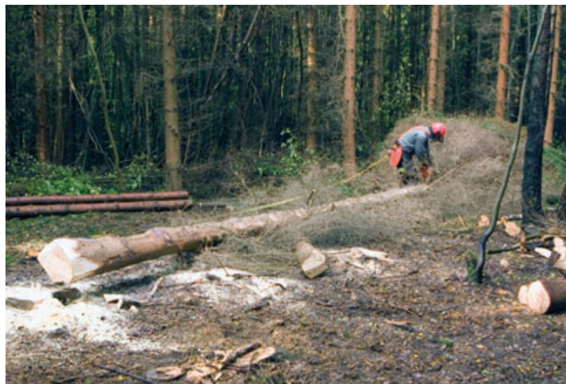
Demonstration of sympathetic felling and extraction techniques at a woodland management event in the High Weald (photo - PM)

above and below ground. Planting on archaeological sites not only results in initial physical damage to the feature - in the long term the root damage will be both physical and chemical.