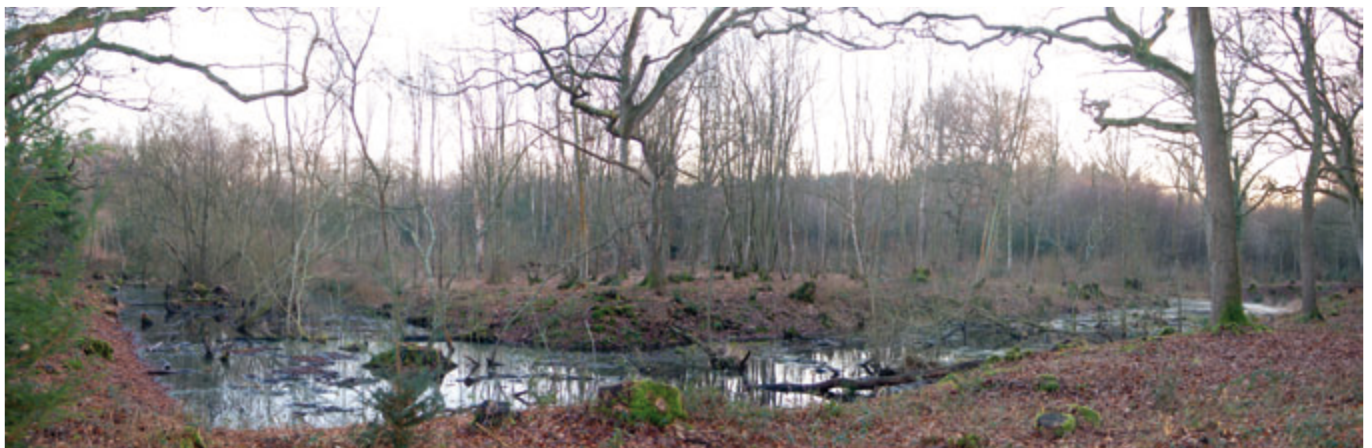
Medieval moat at Moat Wood near East Hoathly, in the Low Weald, sympathetically managed by the Woodland Trust

The presence of a drainage network in a wood, depends on firstly the ground conditions and soils and secondly, how the wood was managed in the past. It is essential before undertaking any work on the ditches in a wood that the full extent of the drainage network is plotted on a map and studied on the ground (see above). This will provide a clearer picture of how the network(s) - there may be more than one phase or period of system present - operated. Identification of main carriers, and lesser ditches and grips, together with culverts and sump ponds will reveal flow of water, especially where they link with the natural drainage of streams within the wood. It is also important to identify wet boggy and waterlogged areas which are likely to be of high wildlife interest.