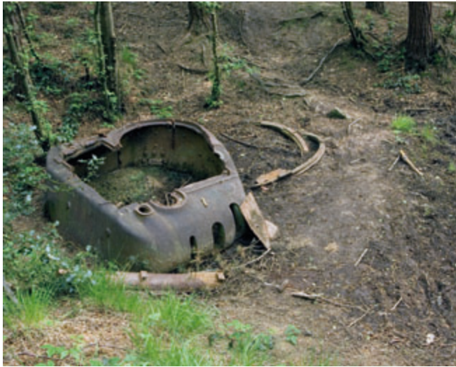
Second World War tank at Broadwater Forest in the High Weald, probably abandoned by the Canadians after military training

earthworks, minimise disturbance to the site; avoid taking vehicles over it or dragging timber across it. If possible manage the site as a meadow or glade, which will also have wildlife benefits.