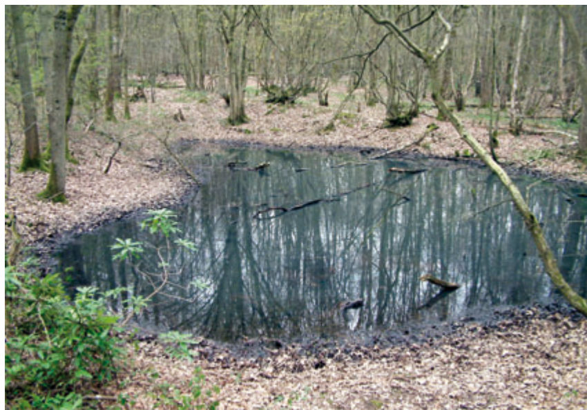
Former marl pit at Dering Wood in the Low Weald in Kent

Identification of buried features is difficult without detailed archive information, or, as with prehistoric sites, by association with extant features. Areas of archaeological potential should be annotated on the management map and in the Whole Woodland Plan. The area of a scheduled site usually includes a 5 metre buffer zone in which possible buried features may survive. A similar buffer zone should be adopted for non-scheduled sites which are of archaeological importance, such as iron bloomery sites. As with