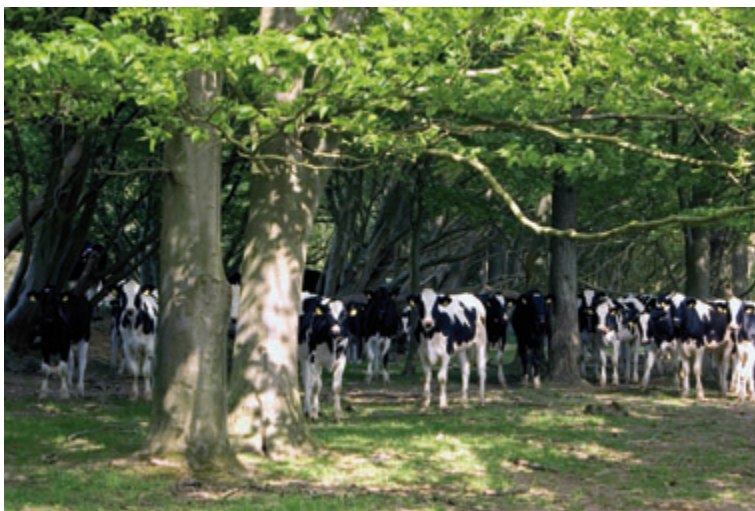
Cattle grazing in woodland

There is an increasing public demand to own a wood or piece of wood. There are a number of companies who buy up whole woods and offer them for resale in small, 1 to 5 acre parcels. Whilst many owners of small woodlands may be aware of the history and archaeological potential of their site and undertake good conservation management 5 , there are situations where owners of small blocks may not be aware of the duty of care needed to manage and look after their woods. Fragmentation in ownership will also result in differing types of management taking place within a small area and also at varying levels of intensity within a single wood, which in turn will impact on the preservation of the archaeological resource.