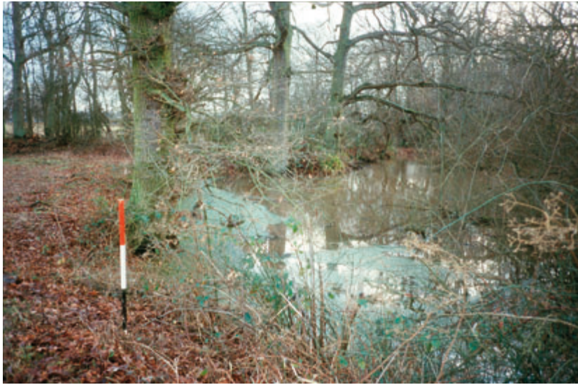
Iron extraction pit in woodland near Penshurst in Kent

makes managing them at breast height and below with a chainsaw difficult and potentially dangerous to the operator. Therefore, do not attach new stock fences to trees using nails, staples, etc., and do not use living trees as fence posts. Not only does this allow disease into the tree, the metal becomes embedded and is then a danger when using machinery, especially chainsaws or circular saws, to manage the tree.