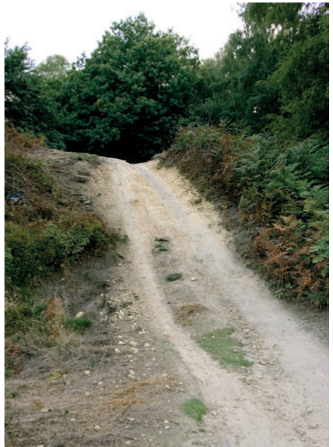
Mountain bike damage to Iron Age hillfort ramparts at Holmbury Hill in the Surrey Hills