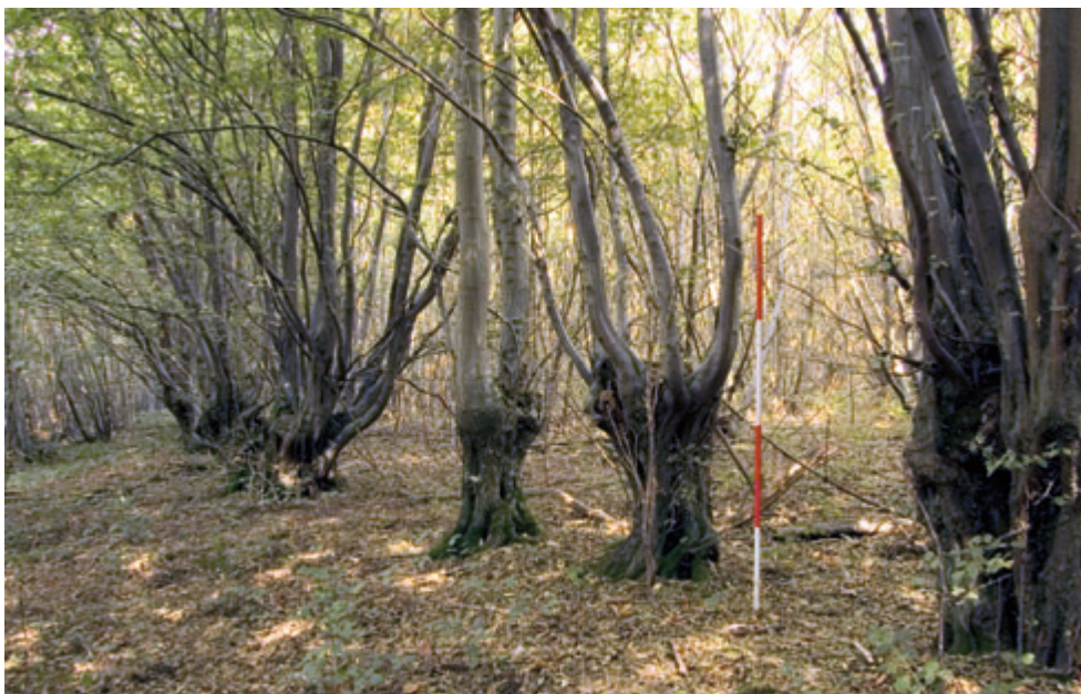
Internal boundary feature with pollarded hornbeam stubs at Denge Wood in the Kent Downs

depending on their origins and often, 'by rule-of-thumb' the larger and more sinuous the bank, the older it is. For example, medieval wood banks which once bounded ecclesiastical woodlands can reach substantial sizes because the boundary earthwork was regularly restored by lay-brothers. Earthworks can exist as independent features, for example areas of mineral extraction, or be associated with other elements of the woodland such as stubs and hedges on boundary banks.