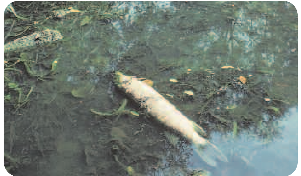
Dead fish in a river

The excessive appearance of one or more of these species is a sure sign that too much fertiliser or nutrients in some form are reaching your ditch. Their appearance suppresses other plant species and reduces the amount of wildlife present. If the ditch is draining a field that has been improved with fertiliser, then there is little that can be done except change the management of that field. However, if there is indirect run-off, then the creation of a grassland buffer zone at least five metres wide will considerably reduce the nutrient input to the ditch.