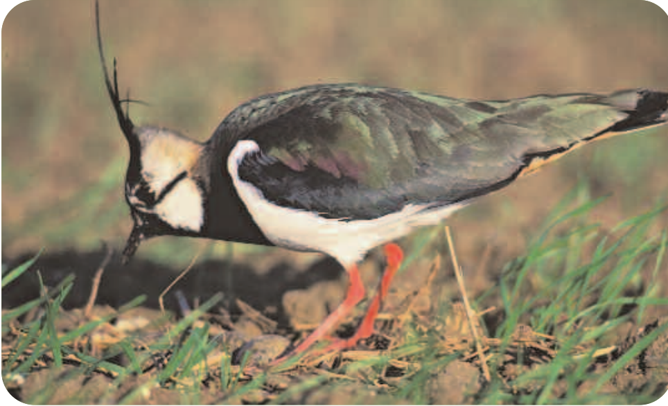
Lapwing (Natural England)

Wet grassland, particularly those with ditch systems are often rich in plants and insect species. The wet meadows provide breeding sites for waders such as lapwing and sometimes snipe, and in the winter provide feeding and roosting areas for much larger numbers. Barn owls are being observed more frequently, with the associated hedgerows and adjacent ditches providing good hunting.