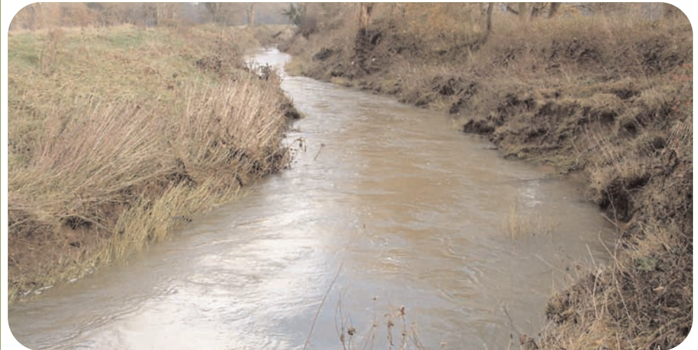
River in Autumn

The Environment Agency will need to see full details of the proposed work at least two months before you start. To begin the process, call the Environment Agency on 08708 506 506 with an outline of the work required and they will be able to advise you on whether consent is required. If it is, you will be required to fill out an application form that should be returned along with a small fee.