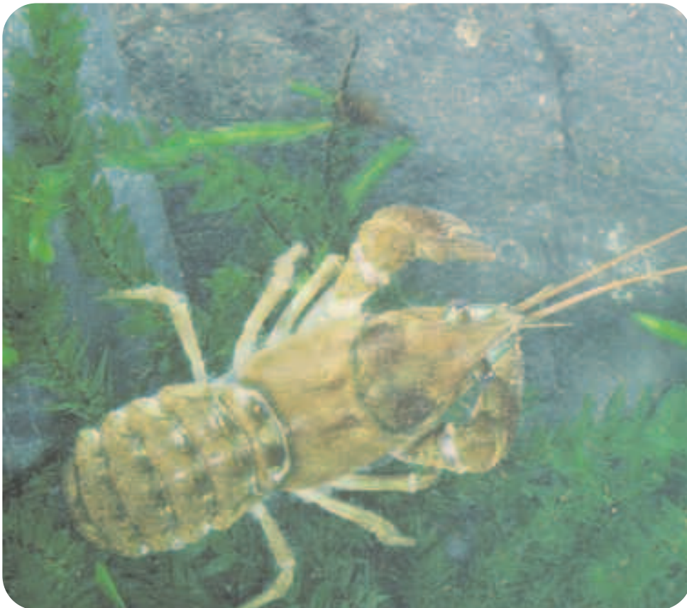
White-clawed crayfish (Natural England)

This section aims to provide as much information as it can to allow those that do have responsibility, to make the correct decisions and ensure that the landscape and wildlife of these streams and ditches are retained.