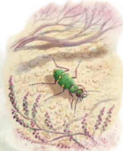
green tiger beetle

Green tiger beetle hunts insects in the sand and heather. Their larvae lead a quiet life hiding in bore-holes in the sand, with just their huge mandibles protruding. Any passing ants are dragged into the holes and devoured.