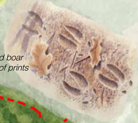
wild boar hoof prints

Sometimes wild boar hoof prints are found at the muddy edges of streams. The animals have escaped from nearby farms and live wild in parts of East Sussex. Wild boar are secretive and rarely seen in the day.