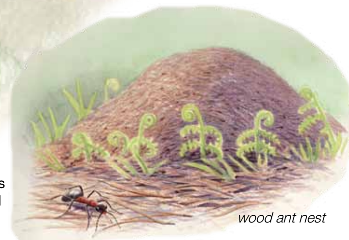
wood ant nest

Large nests of pine needles are made by wood ants, and columns of these insects travel along the forest floor and up tree trunks. Ants bite ferociously and can spray acid on intruders such as badgers.