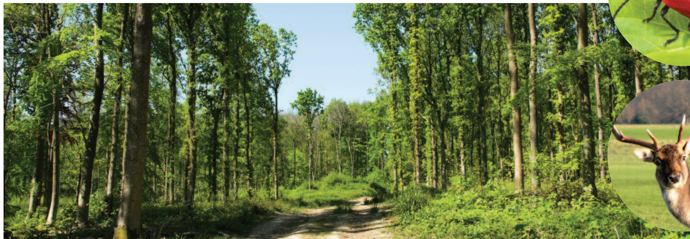
Above: Brede High Woods Species from top: Primrose ; Buzzard ; Red-headed cardinal beetle ; Fallow deer