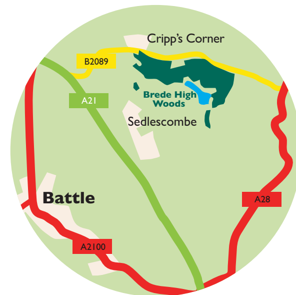
Ordnance Survey map ref: TQ804206.

The nearest public toilets are in Sedlescombe in the public car park off Brede Lane, about 4 miles from Brede High Woods car park. Disabled facilities are available with RADAR key. No baby changing facilities. For more information from Rother District Council call 01424 787878.