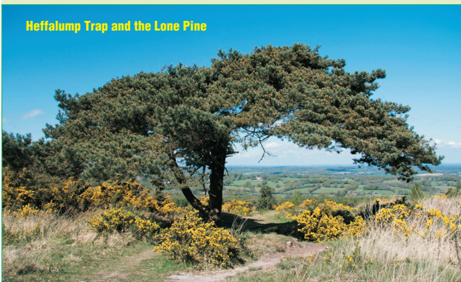
Heffalump Trap and the Lone Pine

To continue, turn left ② and descend on a narrower path to reach the Heffalump Trap , a small hollow in which a Lone Pine grows.