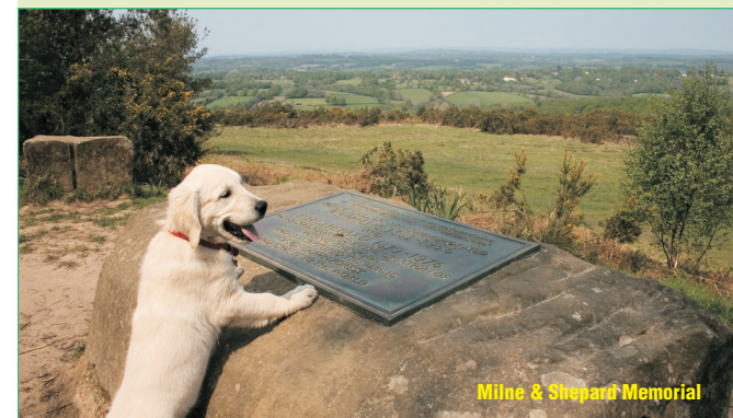
Milne & Shepard Memorial

The Memorial commemorates AA Milne, the father of Christopher Robin and the author of the Pooh stories, and EH Shepard, the illustrator. As Christopher Robin was to write in later life, this was where his father sat and where Pooh sat too; now we can see what they saw.