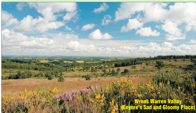
Wrens Warren Valley (Eeyore's Sad and Gloomy Place)

Cross the bridge and ascend the wide ride. Towards the top pass by pine woodland on the left. Turn right at the t-junction of rides ⑥. Follow the ride as it skirts around the rim of the valley.