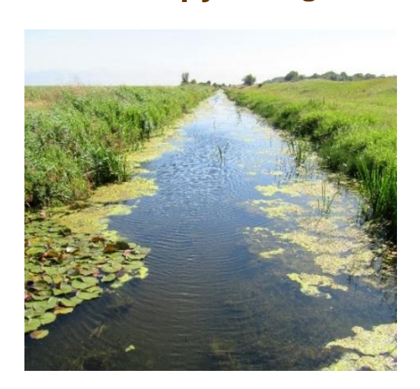
The Royal Military Canal runs for 28 miles (45km) and was built as a defence against possible invasion during the Napoleonic Wars