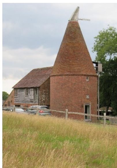
An oast house : once used for drying hops.