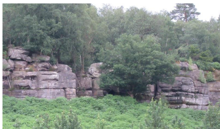
Harrisons Rocks are a superb example of the sandstone outcrops which are found across the High Weald. There is evidence that Stone Age people sheltered amongst these rocks.