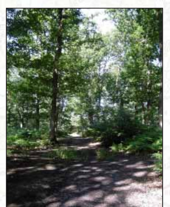
The route through the Wood

Turn right to follow the path through a wooden kissing gate into the Sussex Wildlife Trust reserve of Flatropers Wood. After crossing the small stream, continue to follow the main footpath ahead, bearing left at a small junction after a short distance. The route now follows the path keeping close to the southern edge of the reserve, to reach the unsurfaced Bixley Lane.