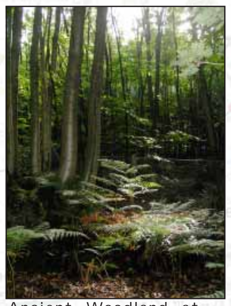
Ancient Woodland at Flatroper's

Continue straight ahead at the path junction to follow the enclosed path to a stile. Beyond the stile follow the field edge path, with the fence to your left. Follow this path ahead to reach Kings Bank Lane. Turn right and follow the lane back to Beckley village and the end of the walk.